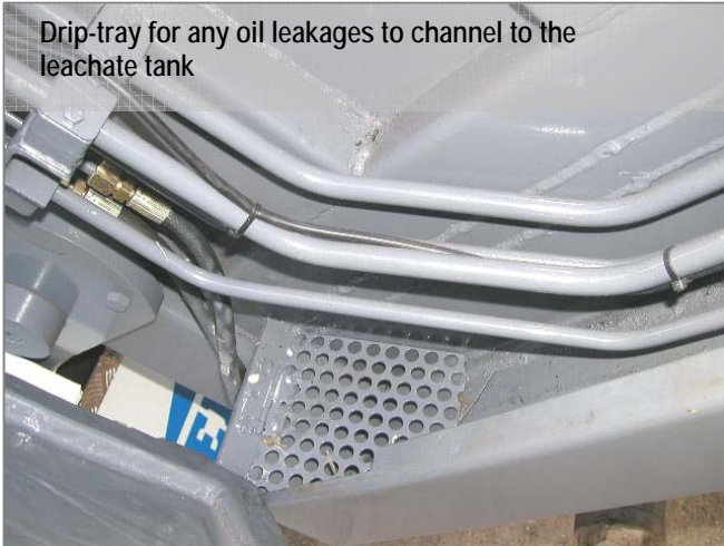
Drip-tray for any oil leakages to channel to the leachate tank