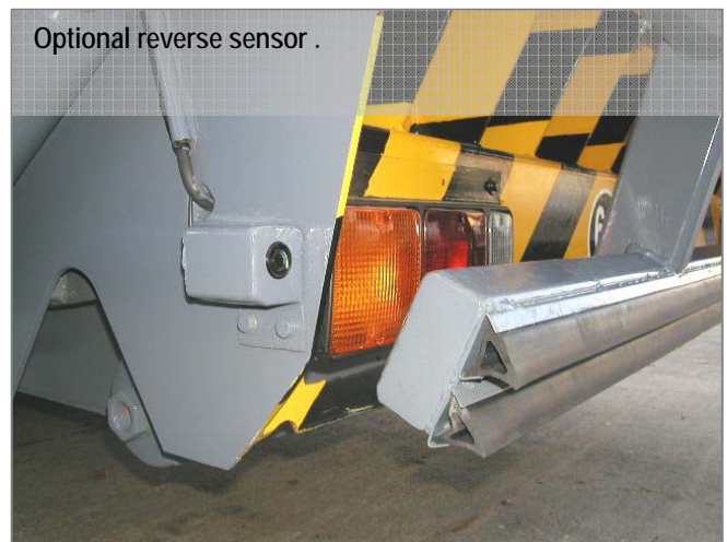
Optional reverse sensor .