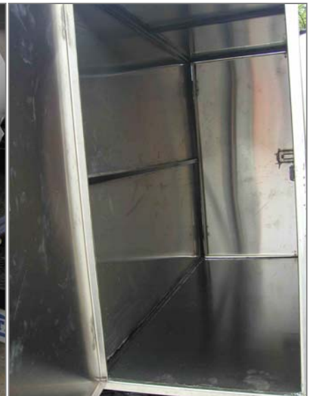
Stainless Steel 304 storage cabinet.