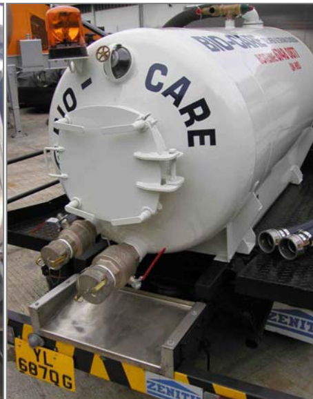
3" inlet, 4" discharge valve with 20" manhole.