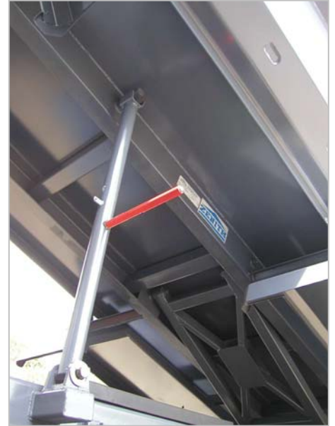
Body prop for maintenance work .

Tipping Speed with engine @600rpm, PTO ratio 1: 1.2 , Pump Flow approx 0.113ltr/rev (Hyva Brite gear-pump PN1456 2035 @ 750 rpm): UP 40 secs (without load) & 50 secs (with load) DOWN 30-35 secs (higher speed is achievable with higher eng-rev or higher PTO ratio or bigger hyd-pump) . Note : maximum recommended raising speed should not be faster than 25 secs for safety reason)