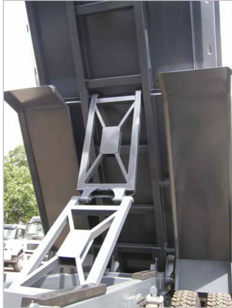
Tip-Stabilizer increases tipping stability