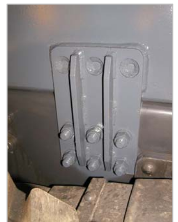
Suitable off-road mounting brackets complying to European truck-manufacturer's recommendations.