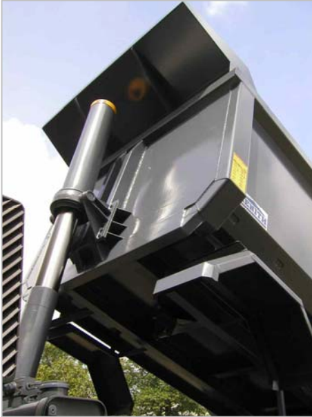
Tipping angle upto 53 deg.