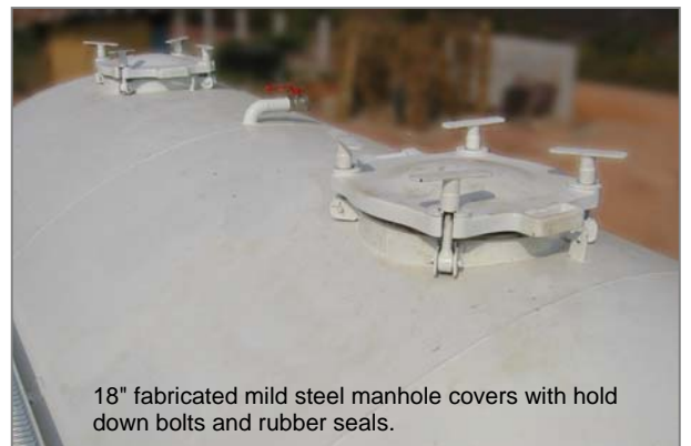
18" fabricated mild steel manhole covers with hold down bolts and rubber seals.