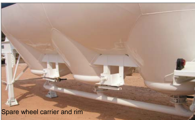
Spare wheel carrier and rim

Fitted with bottom cones with dished ends & fluidisation canvas assemblies and pipe works to connect with discharge system fitted on the primer mover.