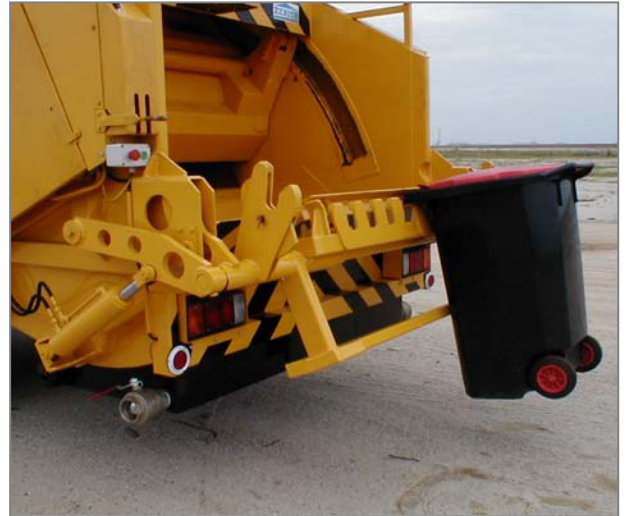
Pictured above is the standard design of Zenith Binlifter for use in Singapore with trunion-arm suitable for HDB metal bins and is also compatible with the HDB CRC dustscrew collection.

Zenith Bin-Lift Model BLT-100 able to lift Bulk-bins ranging EITHER from 120 to 660 ltrs OR 240ltr to 1,100 ltr flat-lid bins, conforming to DIN 30.700 and DIN 30.740 and modified Paladin containers .