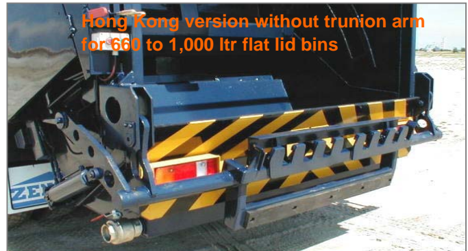
Hong Kong version without trunion arm for 660 to 1,000 ltr flat lid bins