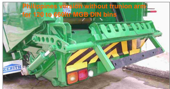
Philippines version without trunion arm for 120 to 660 ltr MGB DIN bins